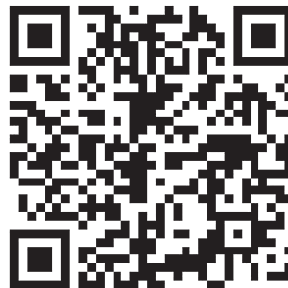
Scan here for instruction video